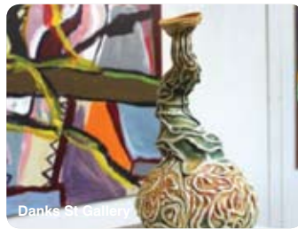
Danks St Gallery